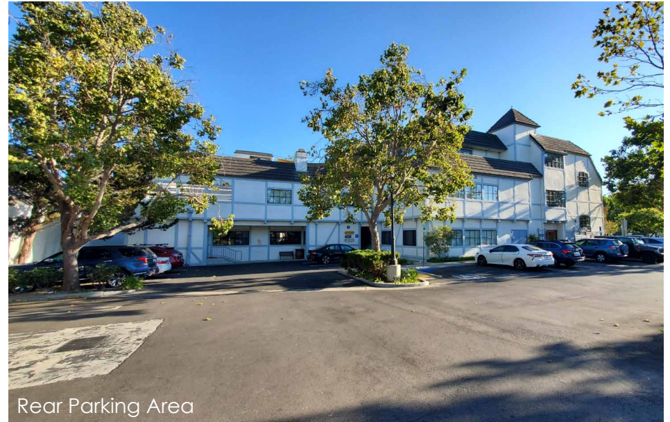
Rear Parking Area

Information contained herein was obtained from sources believed reliable. While we do not doubt its accuracy, we do not guarantee it. Buyer to independently verify.