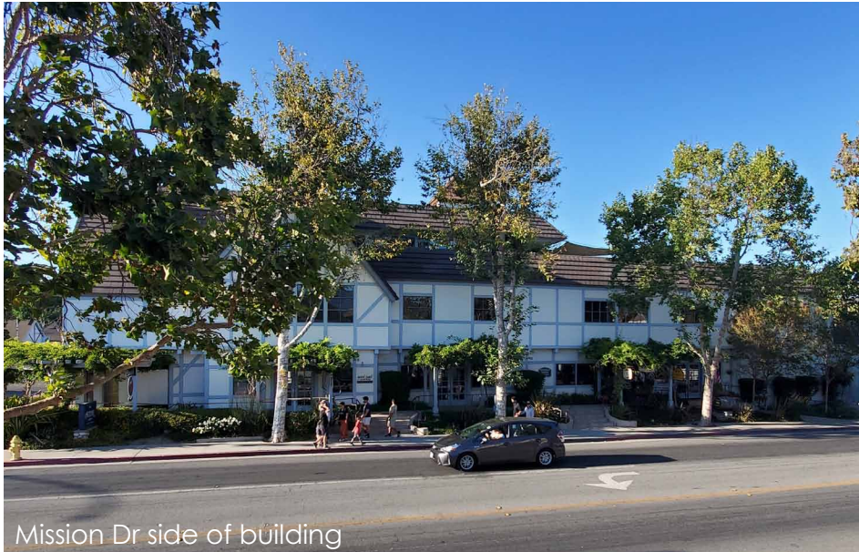
Mission Dr side of building