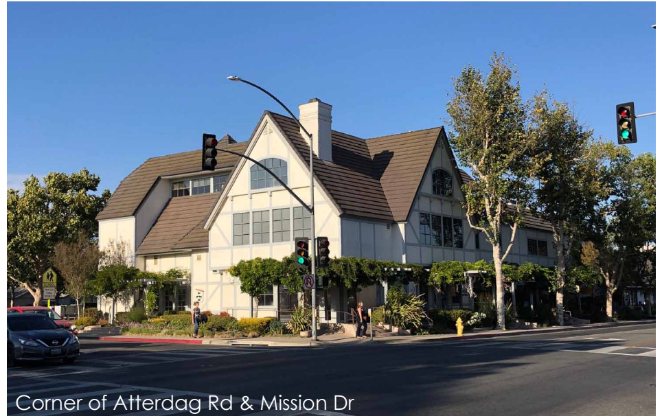
Corner of Atterdag Rd & Mission Dr