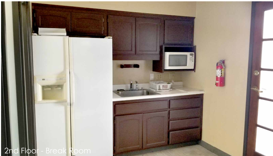
2nd Floor - Break Room