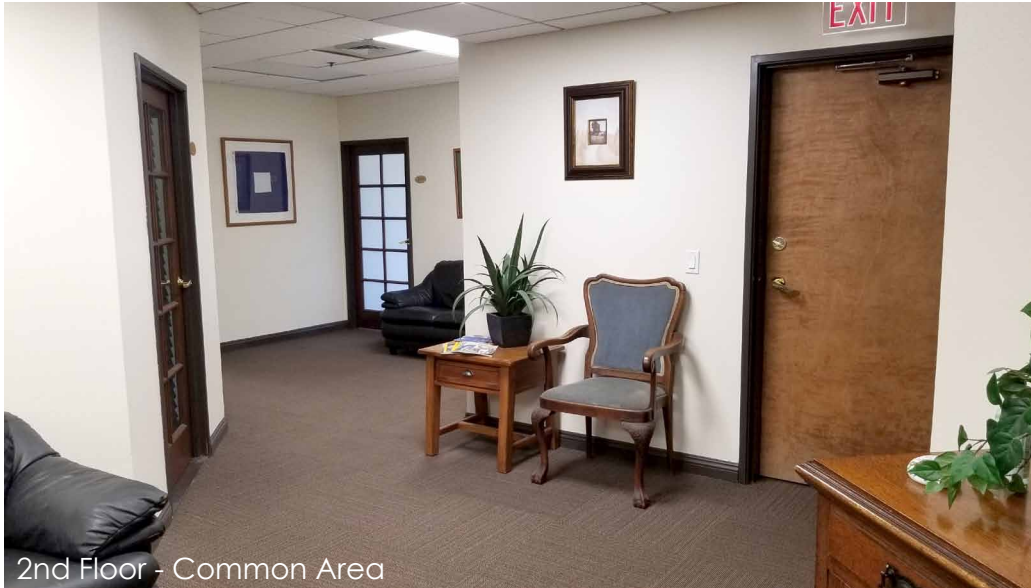
2nd Floor - Common Area