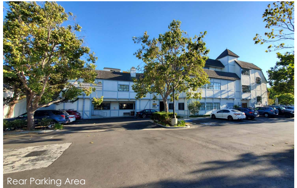
Rear Parking Area

Information contained herein was obtained from sources believed reliable. While we do not doubt its accuracy, we do not guarantee it. Buyer to independently verify.