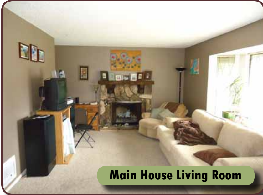
Main House Living Room