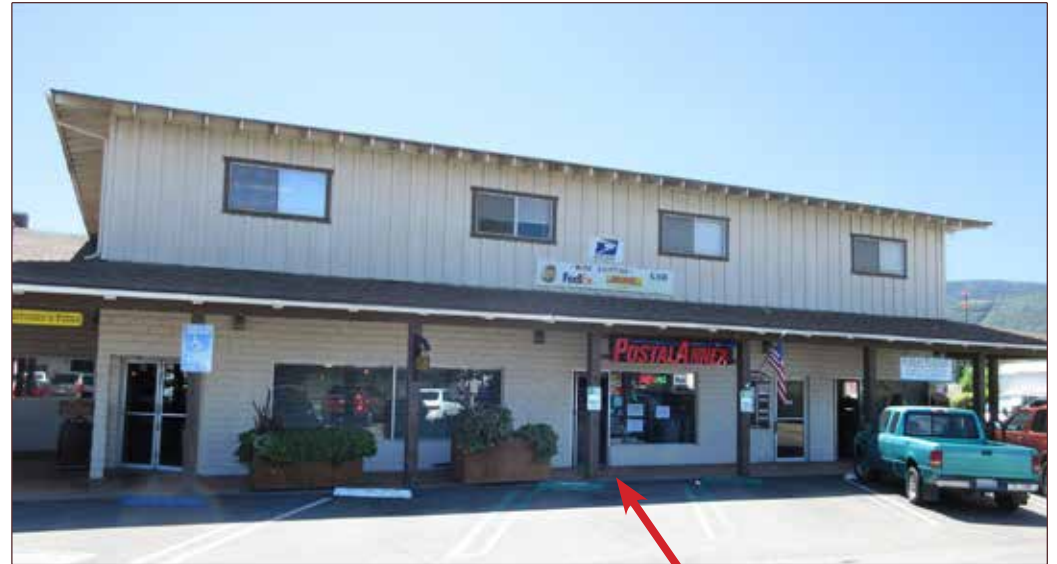
Entrance to Suite 109