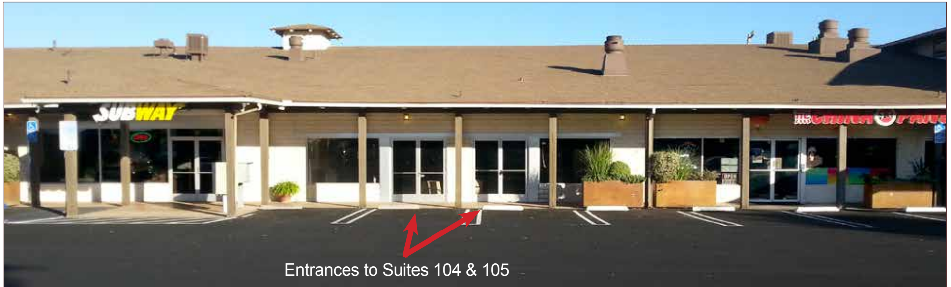
Entrances to Suites 104 & 105

The information contained in this flyer has been obtained from sources believed reliable. While we do not doubt its accuracy, we do not guarantee it.